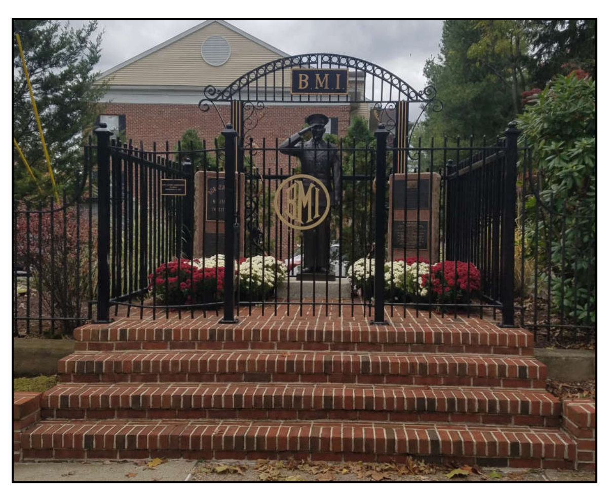
BMI Arch Restored and Installed at Statue Site